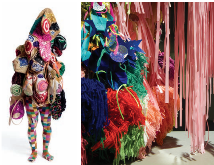
Nick Cave – 2009, Soundsuit – Found crocheted hats and bags, appliqué, knitted yarn Anna Galtarossa – 2008, Il Mostro di Castelvecchio Jr.1 (detail) – Wood, fabric, plastic – 100 x 50 x 50 cm