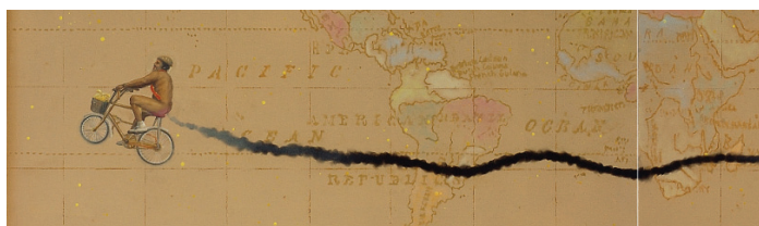
Hema Upadhyay – 2008, Untitled (diptych) – Mixed technique on paper, wooden frame, 45,7 x 45,7 x 25,4 cm cd Balaji Ponna – 2009, A Crazy Migrant (detail) – Oil and sooth on canvas – 121,9 x 243,8 cm