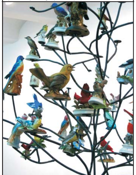
Nick Cave - 2009 Untitled (detail) mixed media 244x111x115 cm cml

VINCENZO CASTELLA + MULTIPLICITY AT ART UNLIMITED - U 29 -