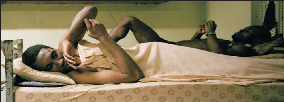
Mikhael Subotzky - 2005 (detail) CELL 33, E2 Section, Pollsmoor Maximum Security Prison, Archival pigmented Ink print on cotton paper 56x151 cm